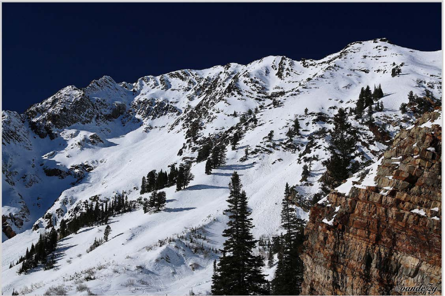
Figure 1: Mt. Superior Ridgeline

Under this recommendation, the four Cottonwood Canyon Ski Areas, local and federal government partners, and conservation and outdoor interests would partner to preserve, for public benefit, about 2,150 acres of Ski-Area owned lands in the Cottonwood Canyons (Figure 2). At the headwaters of Little Cottonwood Canyon, preserved lands would include the areas of Mt. Superior, Flagstaff, Emma Ridge, Grizzly Gulch (under consideration), and White Pine. At the headwaters of Big Cottonwood Canyon, the preserved lands would include Ski Area holdings in the Guardsman Pass, Cardiff Fork, and Hidden Canyon areas.